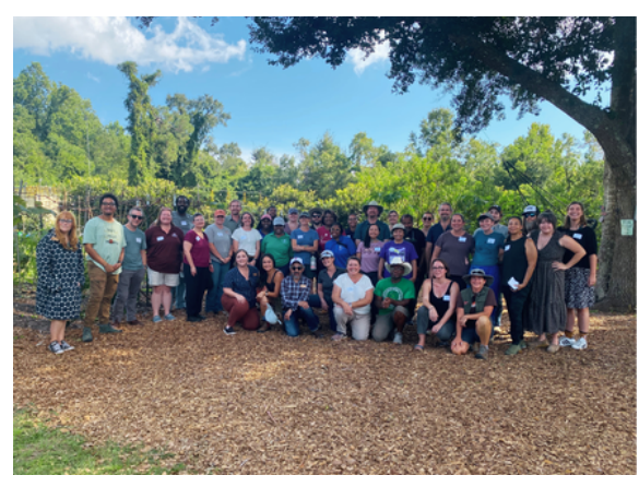
PHOTO: SE TOPP partner organizations came together in Gulfport, Mississippi for the second SE TOPP Partner Annual Meeting.

Expanding the SE TOPP Farmer-to-Farmer Mentorship program by increasing outreach efforts, strengthening mentor-mentee connections, and enhancing support through tailored resources such as updated toolkits and specialized webinars.