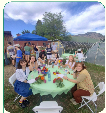
Students participating at Utah State University's Student Organic Farm celebration event