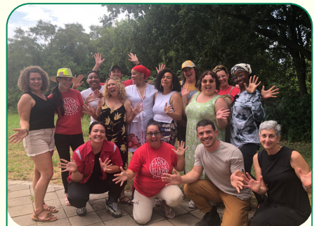
Farmshare Austin Spring 2023 Graduating Class